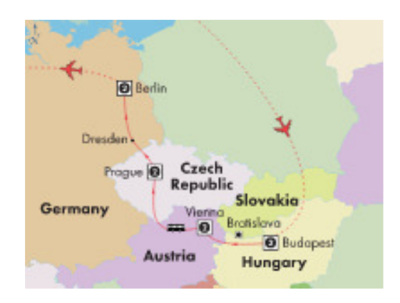
DAY 1, Thursday - Depart for Hungary Depart for Hungary

*call for dates and rates from your departure city